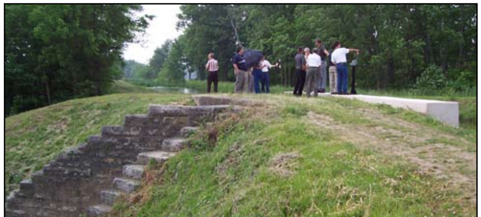
Ohio Water Advisory Council members at 6-Mile Creek Aqueduct.

The hosting of the Ohio Department of Natural Resources, Division of Water Staff and OWAC members included a catered lunch at the MECCA office and a bus tour of the Miami and Erie Canal from New Bremen to Deep Cut, south of Spencerville.