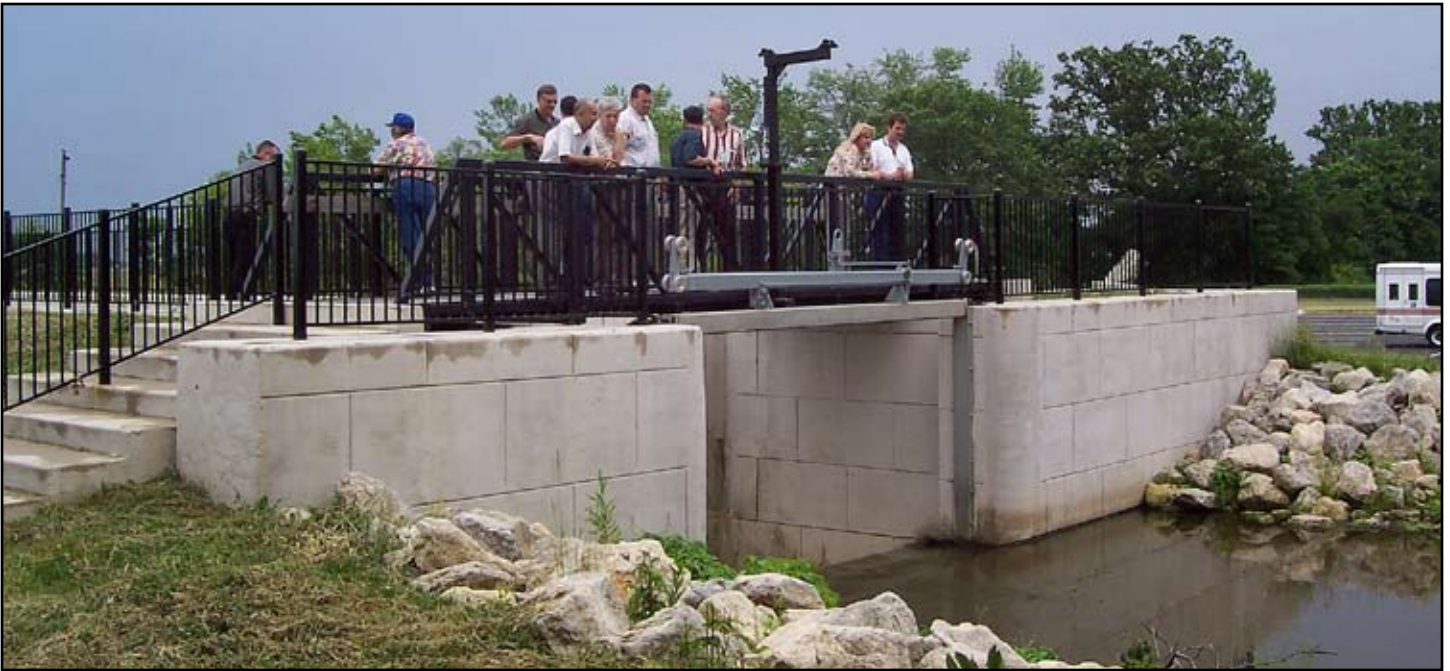
Members of the Ohio Water Advisory Council tour the recent renovations at Lock 14.