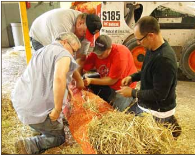
Members of the Spencerville Canal Committee construct barley straw tubes to prevent algae.