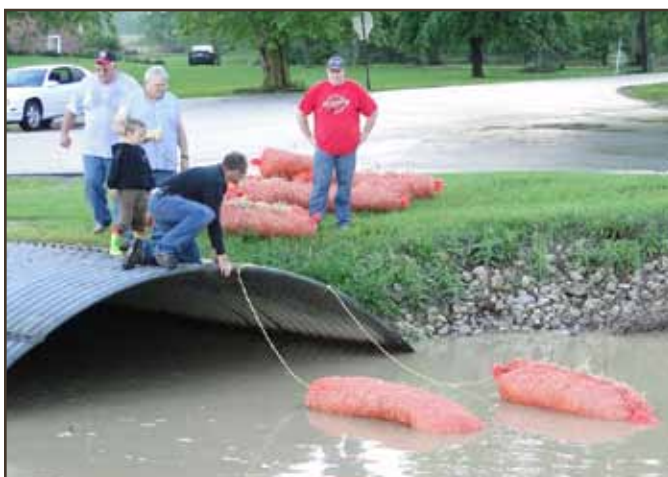
Barley straw tubes being placed in the canal.

The Barley Tube project represents a low-cost method hopefully restricting the growth of toxic blue - green algae that have been found in Grand Lake St. Marys as well as other canal clogging variations of algae